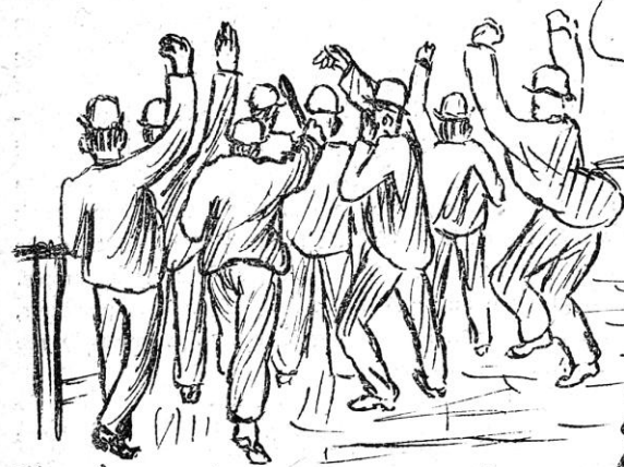
The Crowd become demonstrative.