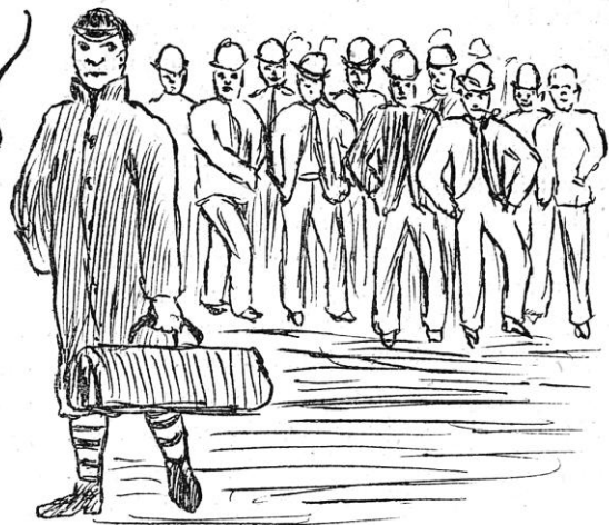
It is suggested that he may be in the bag.