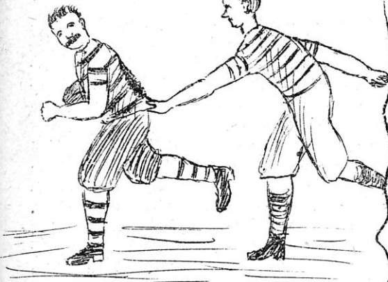
Baggy being collared