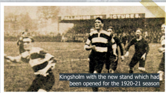
Kingsholm with the new stand which had been opened for the 1920-21 season

They had started the defence of their title with comfortable wins against Devon at Kingsholm and Somerset at Bath, before a last gasp try at Camborne won the south-west group with a hard fought 9-6 defeat of Cornwall. The semi-final was more comfortable, winning 21-3 against Surrey at Kingsholm. Much satisfaction was taken from Gloucestershire being very much home grown, including nine Gloucester players, whereas their opponents were packed with internationals drawn from all four home nations, none of them born in Surrey.