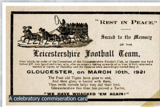
A celebratory commiseration card

The following season, Gloucestershire won the south-west group of the County Championship with a massive 34-3 win over Cornwall at Kingsholm in their final match. They again met Surrey in the semi-final at Kingsholm. As before the visitors were strengthened by internationals from all over the place, including two brought in late on, who played for Blackheath and were deemed to qualify on residence grounds because they lived in an adjoining county! It did them no good as Gloucestershire romped home 30-0, and went on to complete a fine hat trick of County Championship titles with a 19-0 win against North Midlands at Villa Park.