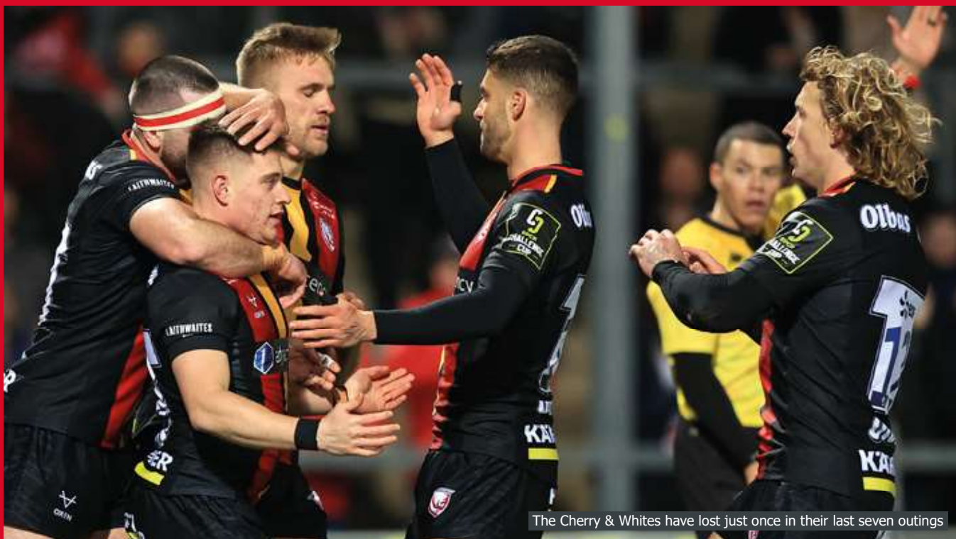
The Cherry & Whites have lost just once in their last seven outings