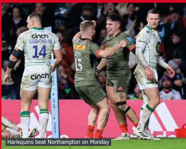
Harlequins beat Northampton on Monday