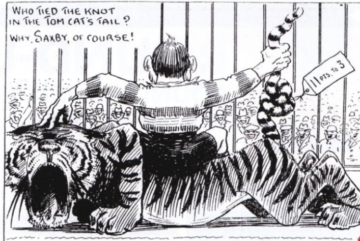
Teek cartoon of Gloucester v Leicester Tigers Kingsholm 12 January 1929