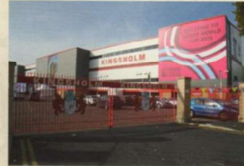
Below - Kingsholm today