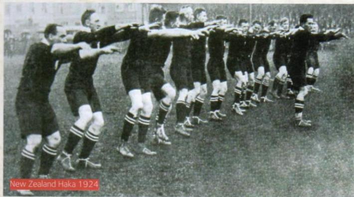
New Zealand Haka 1924