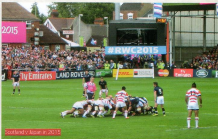
Scotland v Japan in 2015

with a hard cover in large format, presents many facts and figures, but most of all it should serve to bring back memories of great games played by many of the sport's best players on the hallowed turf of Kingsholm. It has been produced by Gloucester Rugby Heritage, a registered charity run by volunteers and supported by Gloucester Rugby and Gloucestershire Archives.