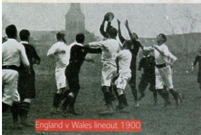
England v Wales lineout, 1900

"Representative Rugby at Kingsholm" records the many matches played over the past 125 years at Gloucester, involving international, county and invitational sides. These teams have