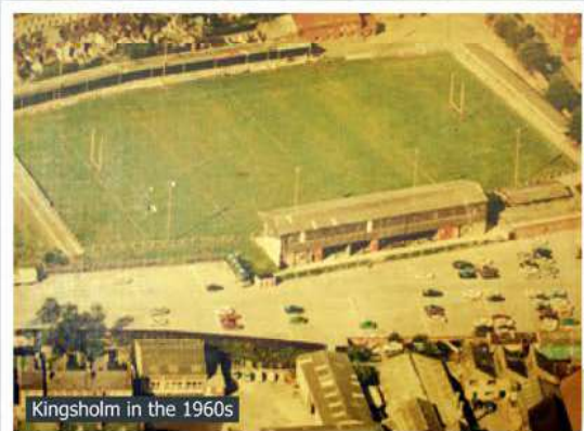
Kingsholm in the 1960s