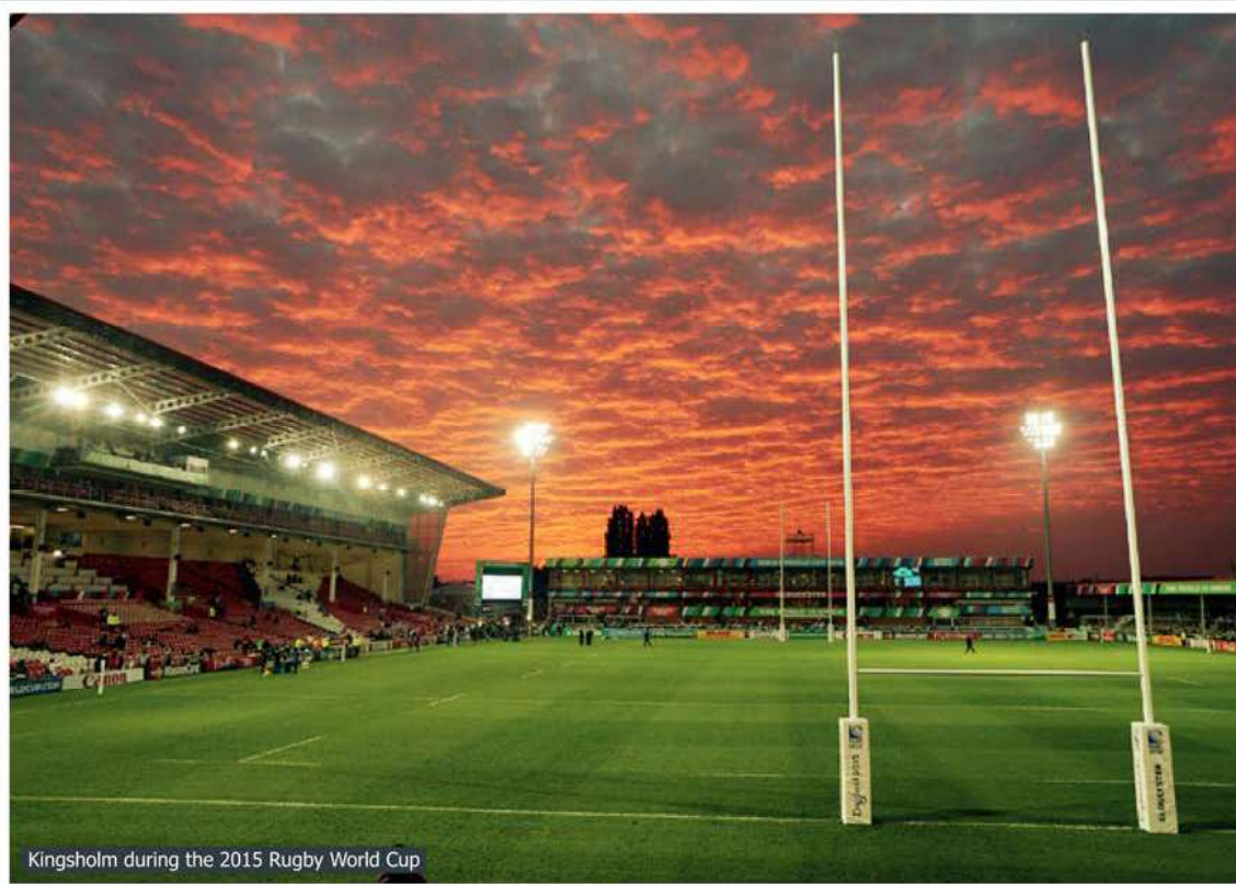
Kingsholm during the 2015 Rugby World Cup

The expansion of rugby coverage on television contributed to a new and better set of floodlights being installed in 1994, and they in turn were replaced when the new stadium was built in 2007. Kingsholm having been selected as a venue for RWC 2015, various improvements to the ground were funded by the tournament organisers, which were afterwards left in place if the Club so wished. Amongst these were new bulbs for the floodlights with twice the previous luminosity. These are quite acceptable at reduced power but can be turned up fully as required for televised matches, which certainly adds to the sense of theatre at a night time match.