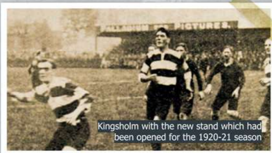
Kingsholm with the new stand which had been opened for the 1920-21 season

They had started the defence of their title with comfortable wins against Devon at Kingsholm and Somerset at Bath, before a last gasp try at Camborne won the south-west group with a hard fought 9-6 defeat of Cornwall. The semi-final was more comfortable, winning 21-3 against Surrey at Kingsholm. Much satisfaction was taken from Gloucestershire being very much home grown, including nine Gloucester players, whereas their opponents were packed with internationals drawn from all four home nations, none of them born in Surrey.