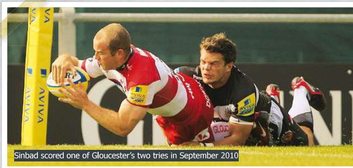
Sinbad scored one of Gloucester's two tries in September 2010

In the professional era the record between Gloucester and Exeter has been very different from the amateur era. There have been 26 fixtures, of which Gloucester have won 11, lost 14 and drawn one. Exeter gained their biggest win, 46-10 on 8th April 2018, and did the double over Gloucester for the first time in 2019-20, a mere 130 years after those first encounters back in the 19th century.