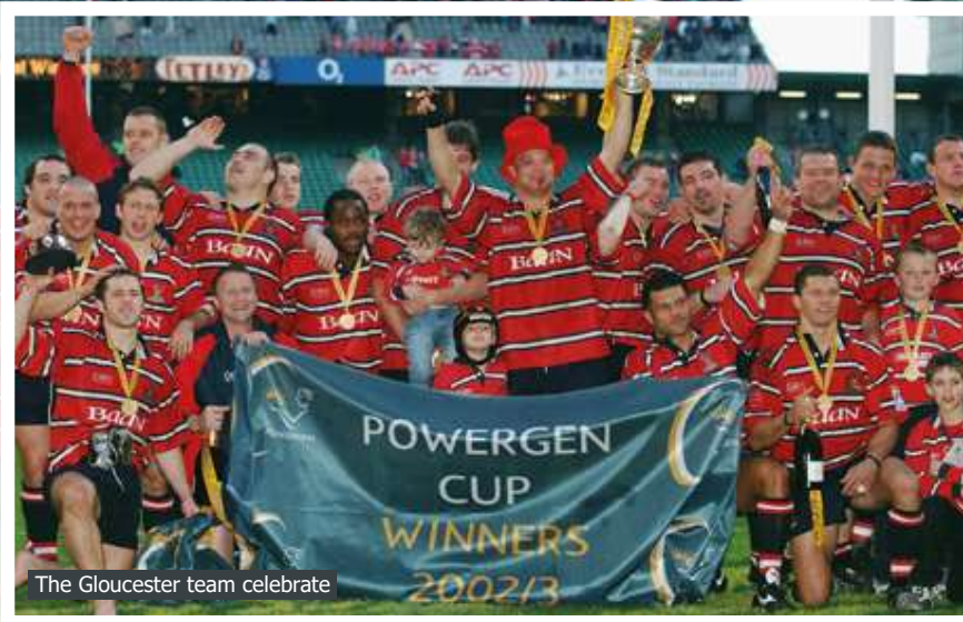
The Gloucester team celebrate