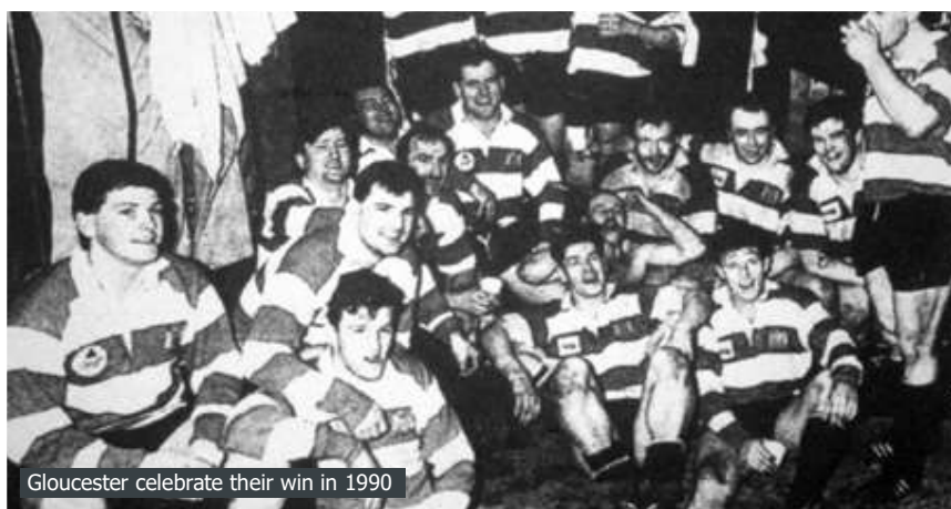
Gloucester celebrate their win in 1990