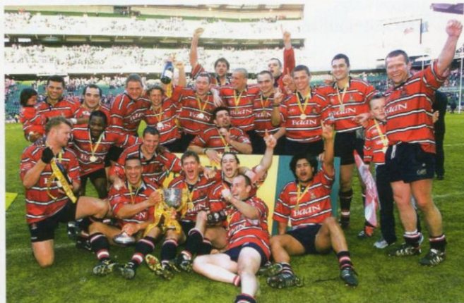
The victorious team with the 2003 Powergen Cup