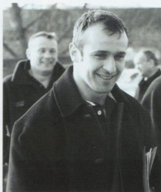
Philippe Saint-André, successful Director of Rugby at Sale, 2004-09, after he had left Gloucester

For the next 40 minutes Sale dominated the game with superb handling resulting in tries for Cueto, Hanley, Marais and Harris,